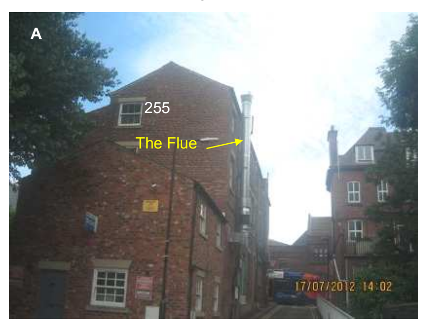
Photo A shows the rear of no.255 looking up Wilkinson Lane towards Glossop Rd

Photo B shows the side elevation of no.255. The red in the bottom corner is the front window to the restaurant.