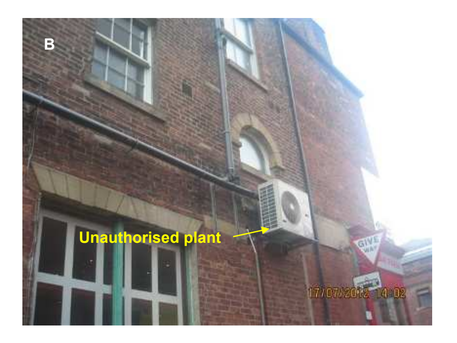
Photo B shows the side elevation of no.255. The red in the bottom corner is the front window to the restaurant.

Photo A shows the rear of no.255 looking up Wilkinson Lane towards Glossop Rd